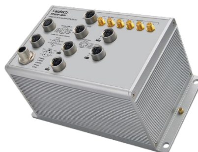
Without 2 serial ports