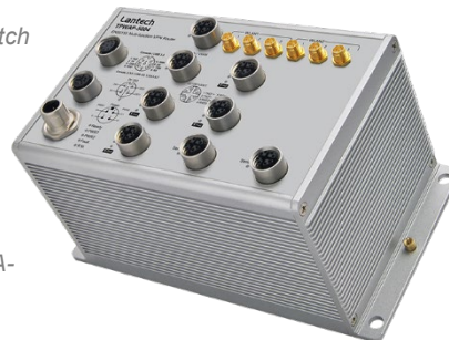
With 2 serial ports