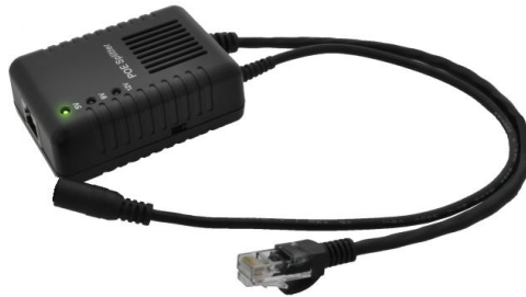
PoE Splitter x 1